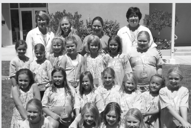
The Electron girls during Hyper-Speed Games.