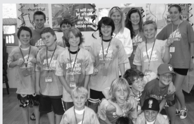
The Neutron boys at the Wacky Craft Lab.