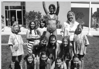
The Neutron girls having fun after Water Works recreation.