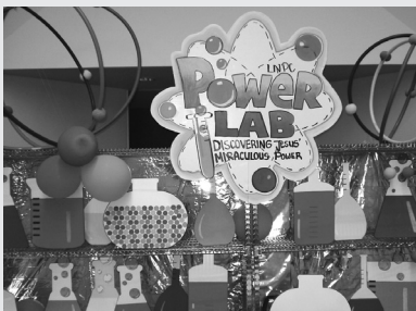
The Power Lab, where we "Discovered Jesus' Miraculous Power."